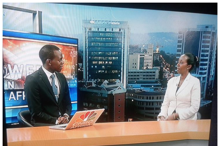
Figure 2: Ag. DG REMA holding a Television talk show on WED 2016 theme on CNBC Africa

The NEW & WED 2016 programs were aired on radio Rwanda, TVR and other different private radio. In this line, two television talk shows were conducted: One by Hon Minister of Natural Resources at TVR and another by Ag. DG REMA at Business news television channel (CNBC Africa). She also conducted a Radio talk show at KFM.