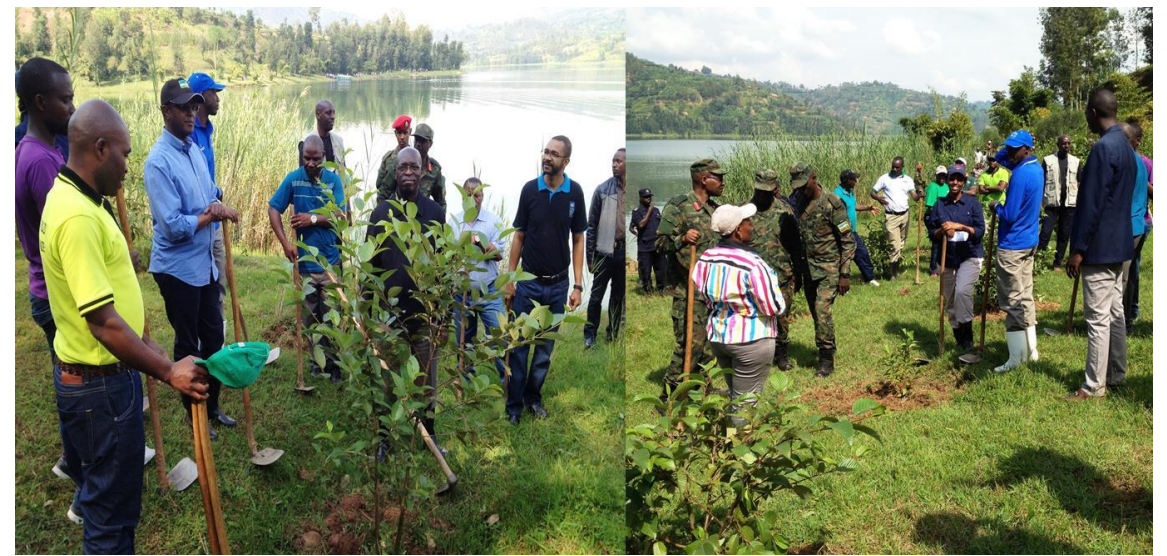
Figure 10: High Authorities participating in the Community Work "umuganda"

Representative from different Ministries and institutions (MINIRENA, MIDMAR, MINALOC, MINAGRI, MINADEF, National Police, REMA, RDB,RNRA, WASAC, RHA, MTN, BK,...) international organizations (UNDP, FAO,IGCP,...), representatives from National Environmental Organisations and local authorities joined Gashaki residents in the community work to manage the planted trees to protect the lake shore of Ruhondo lake.