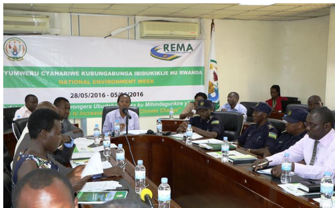
Figure 1: Press Conference on NEW&WED 2016

On 26<sup>th</sup> May 2016, REMA in partnership with the Ministry of Natural resources and other stakeholders organized the press conference aiming at briefing the media on the National Environment Week 2016 theme and planned activities. Panelists included representatives from MIDMAR, RHA, RDB, National Police and the Ag. Director General of REMA. In total 40 journalists from television, radio and print media participated in the press conference.