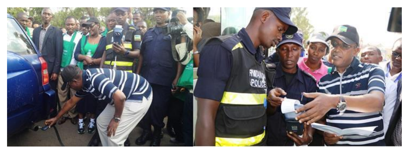
Figure 16: Minister BIRUTA testing vehicle emissions using in hand-mobile materials

During the walk, the National Police took opportunity to demonstrate vehicle air quality emission control using mobile materials.