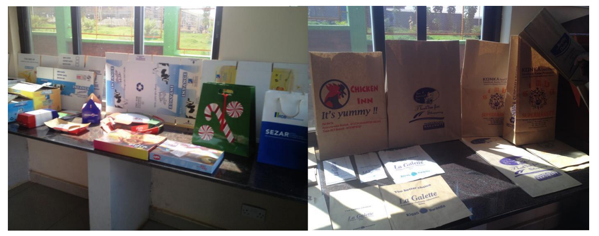
Figure 8 : Printed paper bags manufactured by SRB Ltd

SRB Investment Ltd produces printed paper bags to agro food industries such as Inyange Ltd, La Galette, Chicken In and some supermarkets such as Nakumati, Simba, among others.