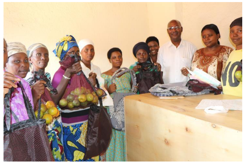
Figure 7 : Environment friendly bags made by women of Tsinda Ubukene Cooperative

"Tsinda Ubukene Cooperative" has benefited REMA support to make environment friendly bags through Poverty Environment Initiative (PEI) project.