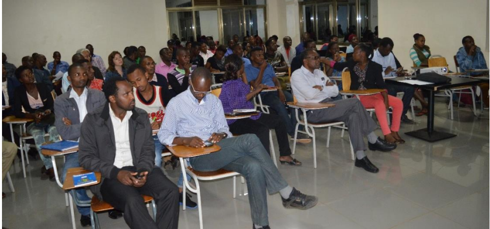
Figure 5: Students from Protestant Institute of Arts and Social Sciences, Huye, Southern Province.