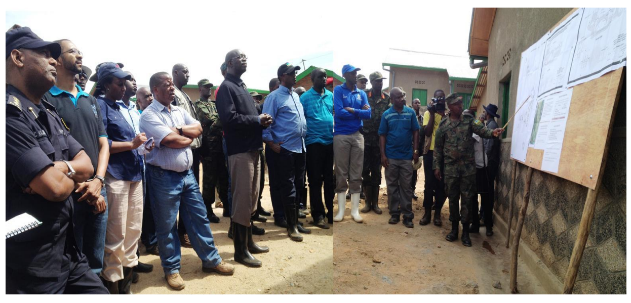
Figure 12: Rwanda Reserve Force presenting the construction plan for Gashaki green village