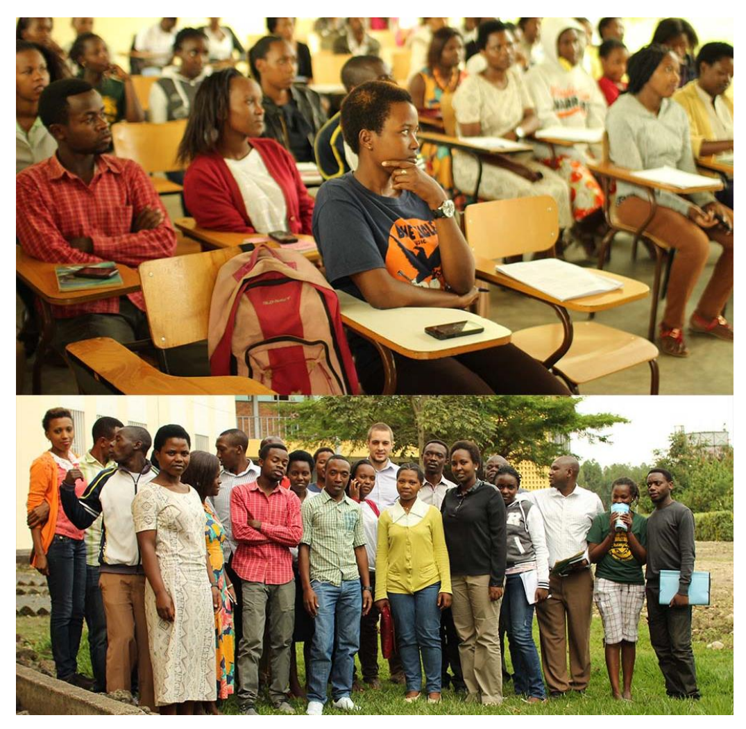
Figure 6: Students from INES Ruhengeri, Northern Province

Since 2012, Rwanda Environment Management Authority (REMA) works closely with the Higher Learning Institutions (HLIs) and schools to celebrate the World Environment Day (WED). This involves different activities such as public lectures, debates, essays and poem writing to raise public awareness on the importance of World Environment Day (WED) and the National Environmental Week for environmental sustainability.