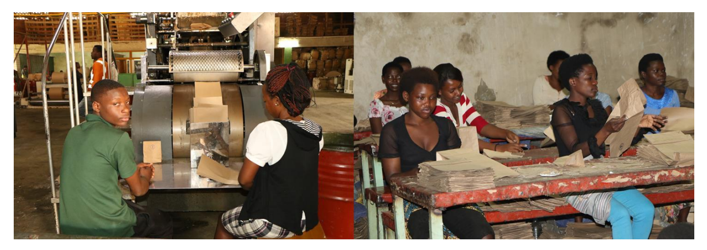
Figure 9: SRB Ltd workers need protective equipment

Even if the industry is still on its early stage and depends on importation of processed materials (kraft paper) to make paper bags, there is a need to improve workers safety by providing appropriate protective equipment.